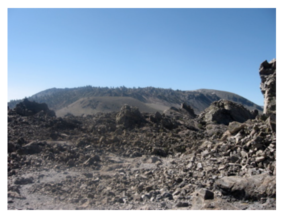
Spiky desert volcanoes of obsidian