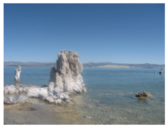
Tufa towers at Mono Lake