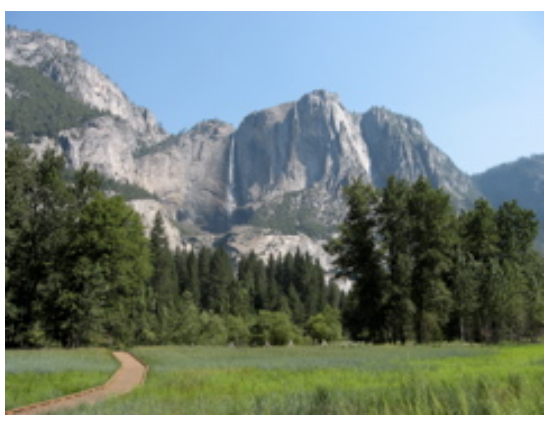
Yosemite Falls in Yosemite Valley